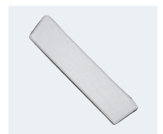
WORKS WITH DISPAD