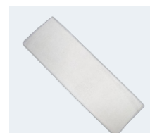
DISPOSABLE PAD (requires Dispad.)